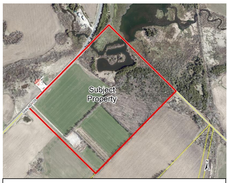
Figure 1. 2020 Aerial photo of subject lands

The purpose of this application is to provide relief from Zoning By-law 66-01 specifically Section 6.8 a) to facilitate the construction of a shop and office on private well and septic within the urban area of Mount Forest.